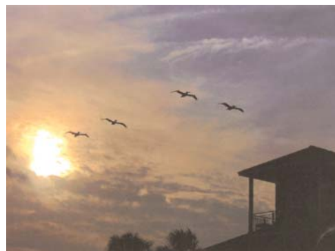
Reflections Contest - 1st place

A donation from every MBUSD family goes a long way to meeting this goal. Please donate what you can. Thank-you!